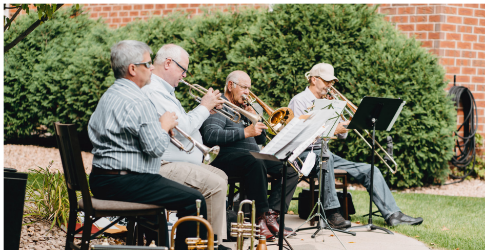
Members of the Wooddale Brass

this ministry. Once the pandemic closed off senior living communities, those volunteers made phone calls and ran errands for some residents. Recently, members of the Wooddale Brass performed a physically distant concert in the courtyards for some of the senior communities.