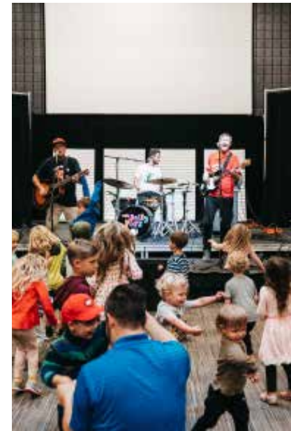
Room 100 transformed from a gym into a student ministry space