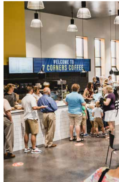
Bookstore became Lydia's Coffeehouse, then 7 Corners Coffee