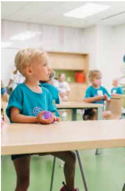
Woods Kids space transformed